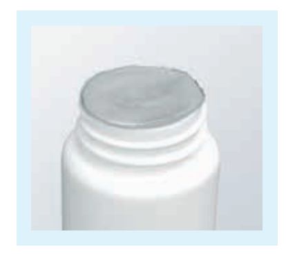
Underheating (cold soldering)